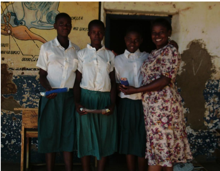
Some of school girls who are beneficiaries of the Sanitary towels project

This project was funded by Smiles To Tanzania has shown enormous success in helping keep girls in school during periods, Girls tend to miss school when they are in this state to avoid embarrassment if their classmates found out, with sanitary project Girls benefited from this project say they are now able to stay in school without worrying and pursue their studies through out the month, LVC continue sourcing many items in the Tailoring shop and distribute them to needy girls in primary schools