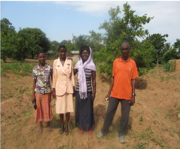
LVC Executive committee members standing in front of the LVC land

We have purchased a piece of land where we can eventually build a permanent LVC centre and do away with paying so much money in rents, this has been LVC dream to purchase a piece of land and look for support to build the centre, this was generously funded by Kids Aid Tanzania who are now also looking into ways to hopefully support us if possible with funds for the construction of the centre, this is not guaranteed yet but having the piece of land itself is a huge steps forward for our Organization