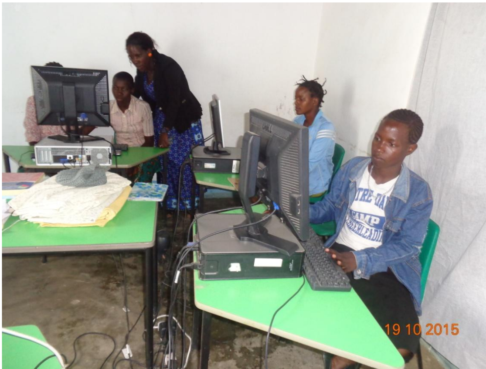
A computer class going on at LVC

opportunity to proceed to higher learning some of them didn't even make it to Secondary schools due to their disadvantagedness , the LVC community computer class provides them with second chance to learn computer skills which will help enhance their knowledge and increase their chance of getting employment especially where computer application is necessary, the current class has 9 girls, they need at least 6 months of training to be competent enough, they are enjoying the training and they all feel they are achieving a lot a teacher has been employed specifically for the community computer class .