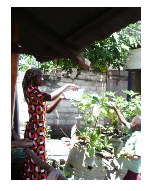
The Sack garden project

"The sanitary towels are very small things and don't cost much to make, but the difference they make to the girls in the community is incredible! "Neema of LVC Tailoring shop